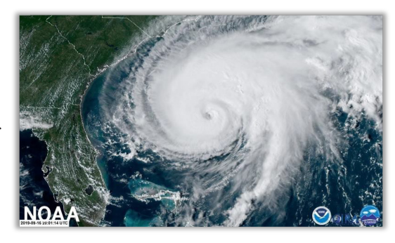
Figure 3: Hurricane Humberto Satellite Image nesdis.noaa.gov/news/noaa-sees-the-fifth-hurricane-humberto-through-

female wind goddess Gaubanacex. They say that she called upon her assistant Gautauba, God of Thunder to announce her arrival. Gaubanacex then rotated her arms in a spiral to pick up the ocean and gave it to Coatrisque, Goddess of the Flood, to wash over the villages of the Taino people as rain (Lasche, 2016; Velez, 2008). It seems that the indigenous peoples recognized the counterclockwise swirling of hurricane winds, and the eye of the storm, which they represented as an angry woman's face. This ancient name and symbol are both remarkably similar to what we use to denote hurricanes today, and the artwork we see of Huracan is an exact depiction of the swirling depressions we see via satellite images (Figure 3) from National Oceanic and Atmospheric Administration (NOAA) and via other sophisticated technologies in modern times.