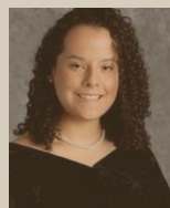
2020 EA Scholar's