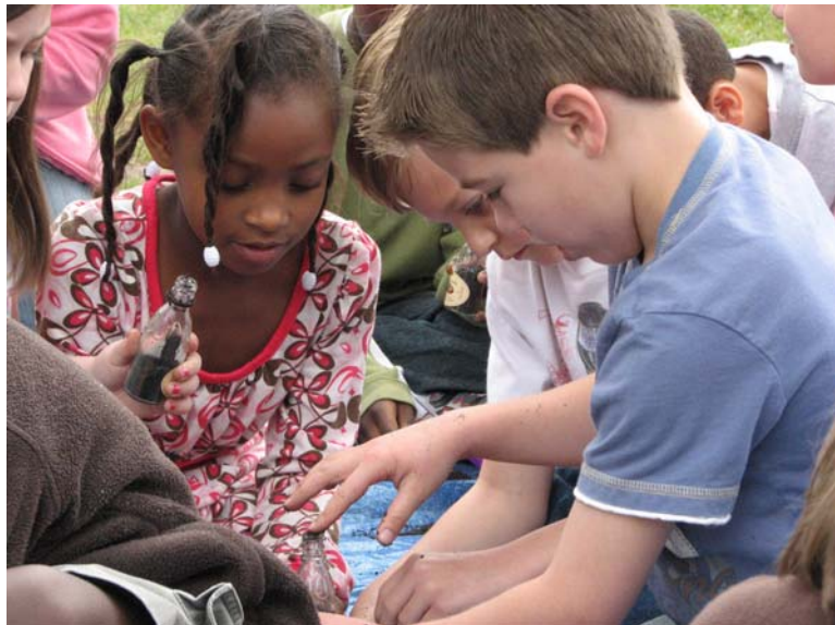
The faces said it all at Earth Day.

The students rotated from station to station for hands-on activities that were held outdoors in the school's B.E.A.R. Garden. B.E.A.R. Garden stands for Building Environmental Awareness & Respect. The Earth Day celebration was planned and directed by the UNCP students in Rebecca Berdeau's (Education) class, "Teaching Science and Health in the Elementary School."