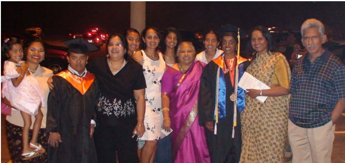
The graduates with family members