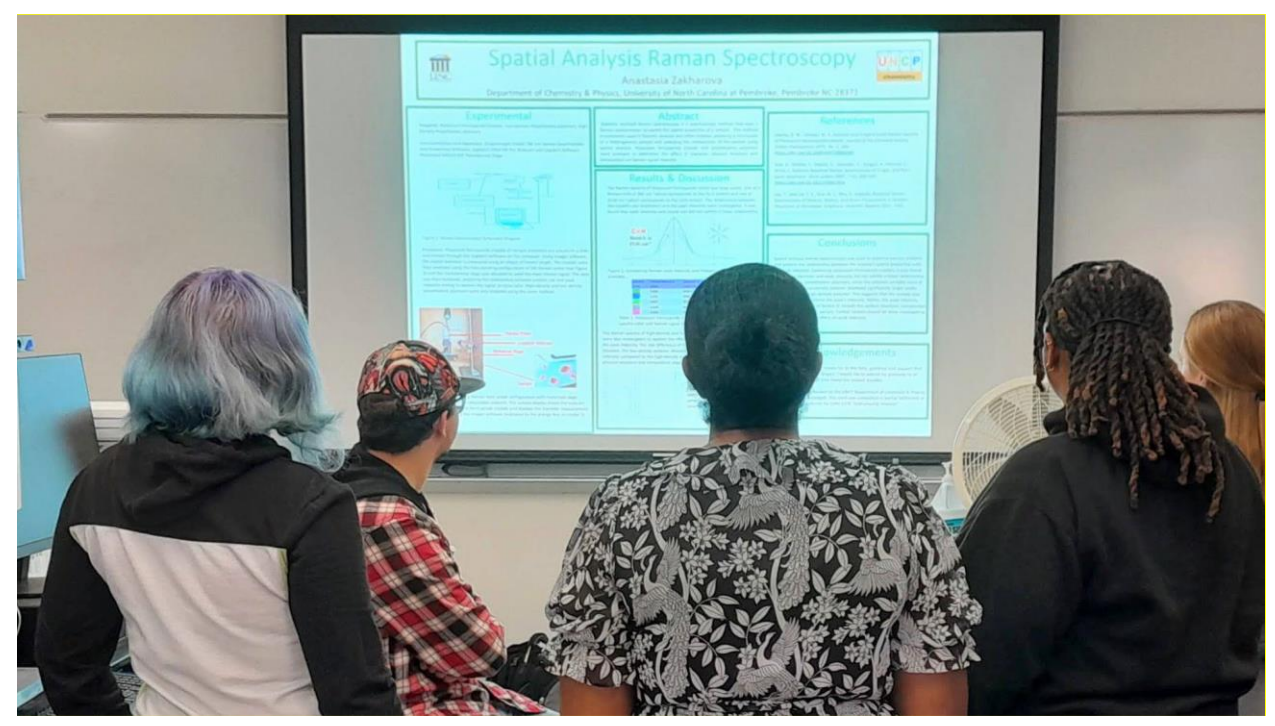
Anastasia Zakharova presenting (in absentia, via pre-recorded audio)