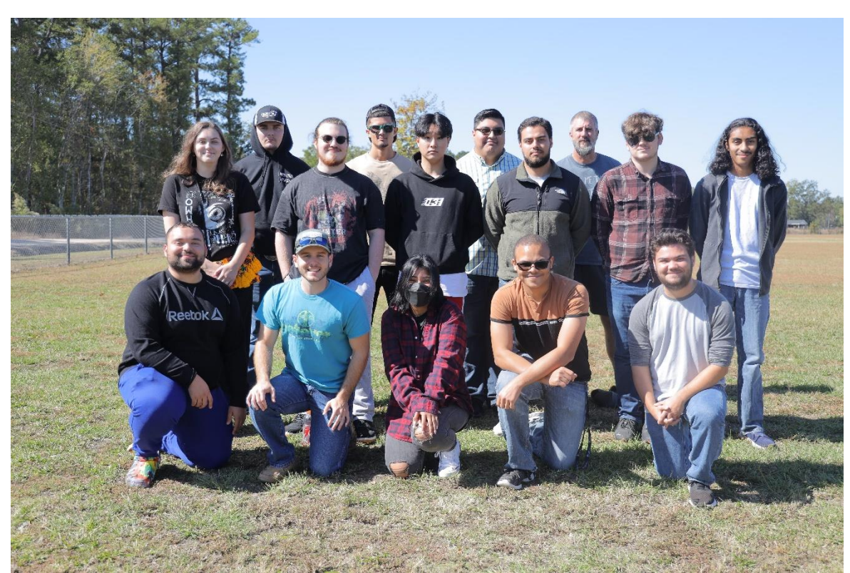
The UNCP Rocket Team has been selected to compete in the NASA Student Launch Challenge in Alabama in April 2023