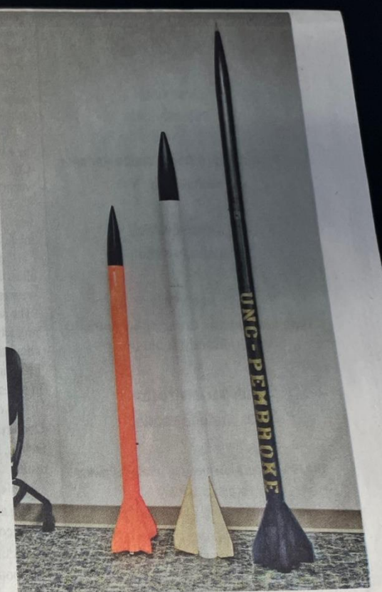
The orange and white rocket in the photo were used for testing. The black rocket was used in the last competition.

Anyone that's interested can email here at steven.singletary@uncp.edu or on Instagram @uncprockets.