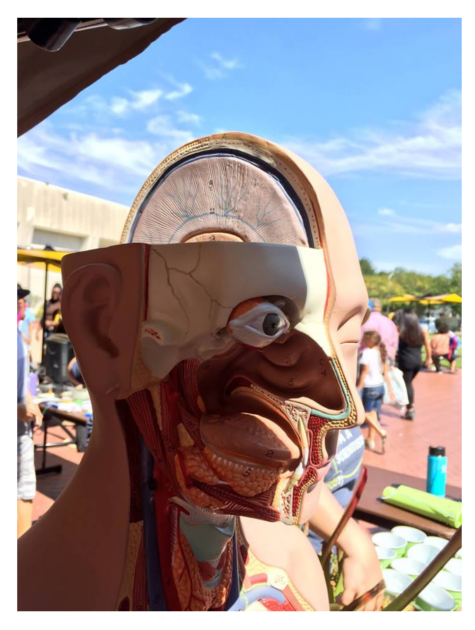
Program with Abstracts