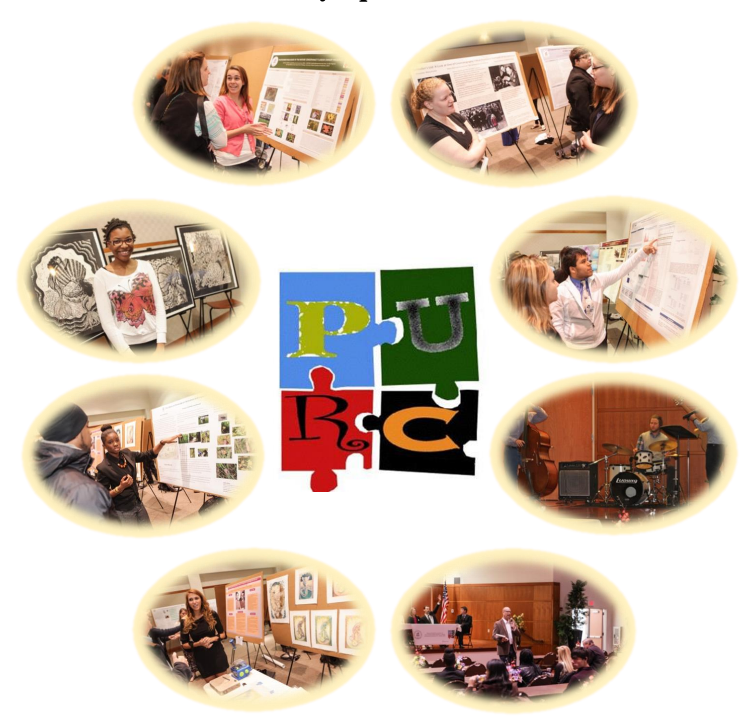
April 2, 2014 Program with Abstracts