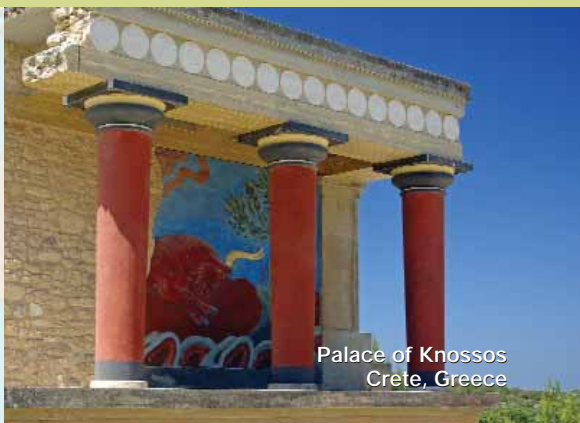
Palace of Knossos Crete, Greece