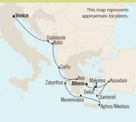
This map represents approximate locations.

The agreement in this brochure is the exclusive and entire statement of the agreement between you and Go Next, Inc. It should be read carefully.