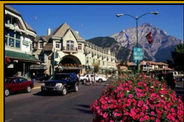
The Canadian Rockies