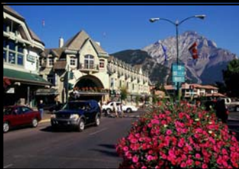
The Canadian Rockies