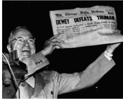
Illustration is positioned close to the text to which it relates, with figure number, caption, and parenthetical documentation.