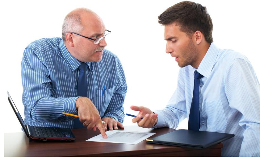
Advisor Attorney/Non-Attorney Advocate Support Person

Hearing Panel Chair: decides all relevancy issues in real time