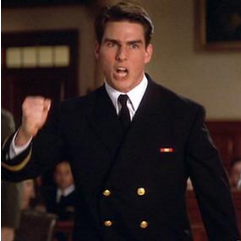
Cross-Examination of Parties by Advisors