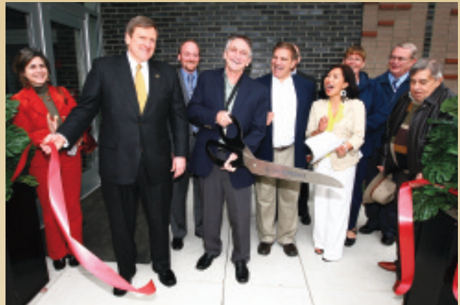
University dedicates Biotechnology Research and Training Center