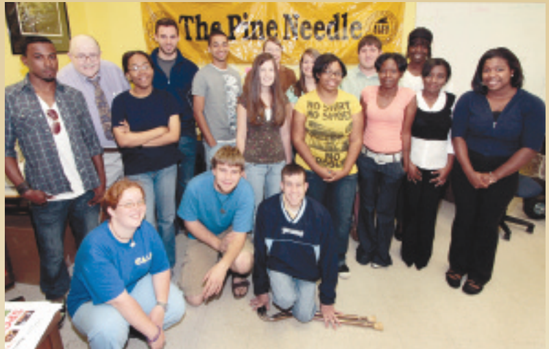
Pine Needle staff