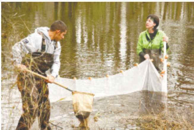
UNCP scientists peer into the black waters of the Lumber River.

There were more surprises in store as the investigation moved forward, she said.