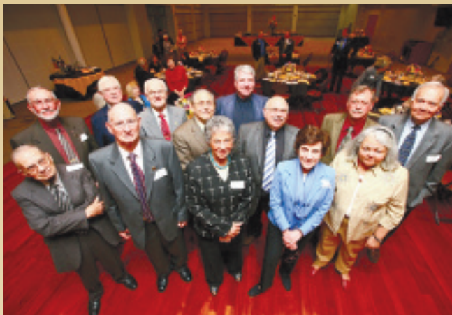
The largest group in its history turned out for the annual Retired Faculty Club Dinner on March 10.