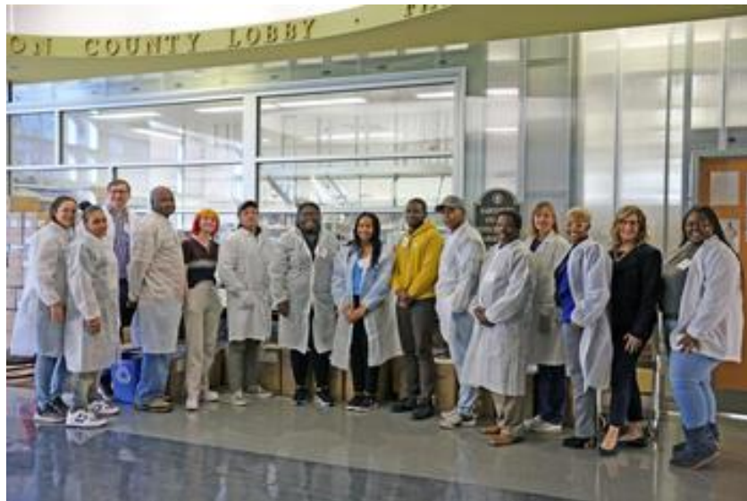
Inaugural Cohort for the Accelerate NC – Life Sciences Manufacturing Bioprocessing Training Program

For more information or to register, visit uncp.edu/biotraining .